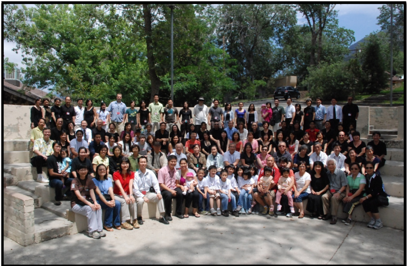
2009 CAMP CEDAR FALLS CHURCH RETREAT 2009 年杉林瀑布營教會退修會

~~ WRITTEN BY PETE LOU AND TRANSLATED BY PAUL CHO~~