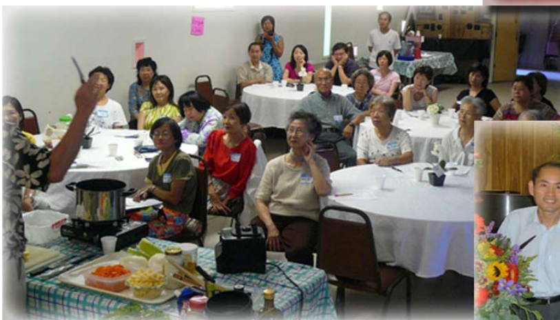
THE SACRED MUSIC CONCERT OPENED UP OUR 3RD EVANGELISTIC SEMINARS. IN 2009, WE CELEBRATED OUR FIRST ANNIVERSARY AS A CHURCH COMPANY.