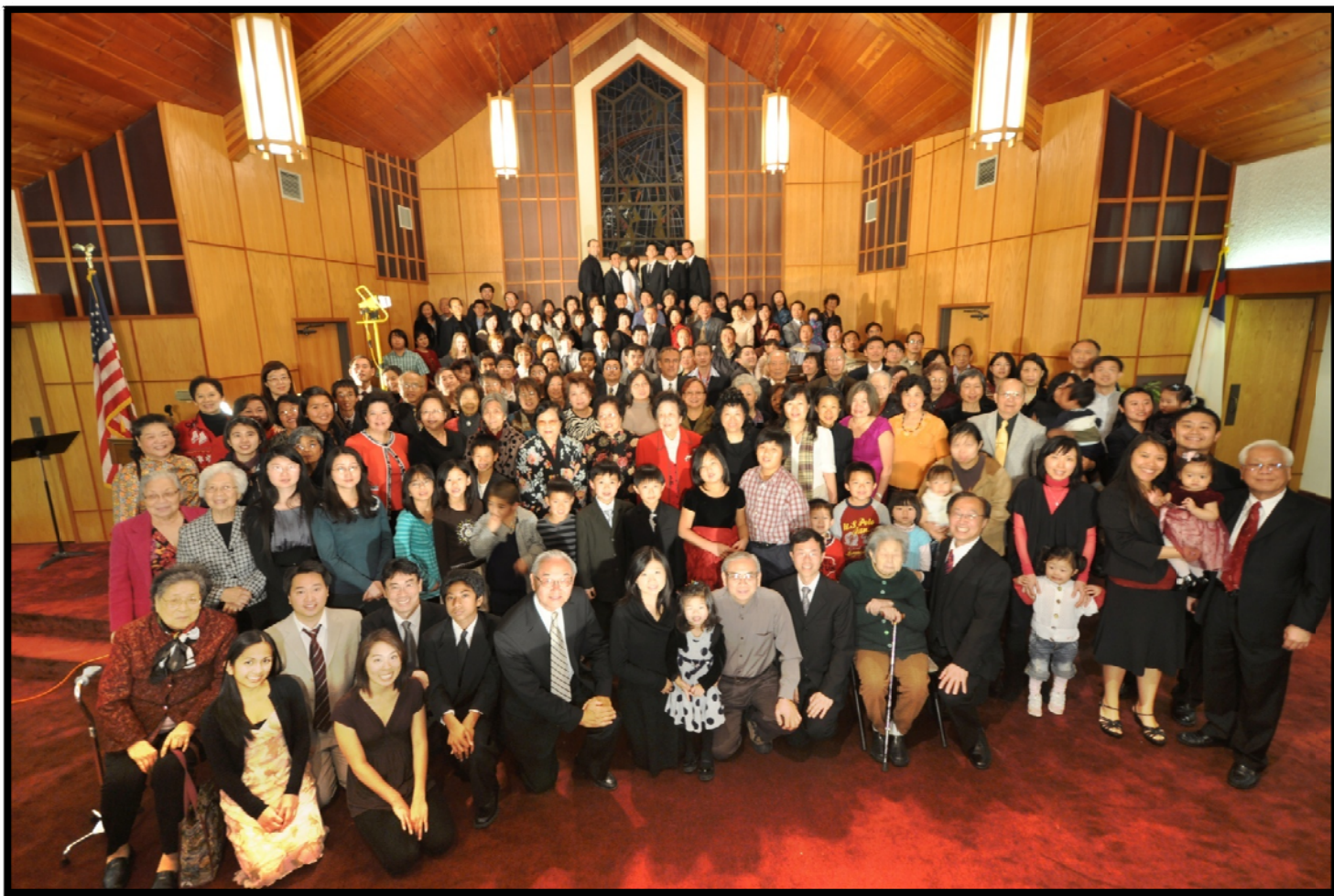
CHURCH FAMILY GROUP PHOTO 全體教友合照