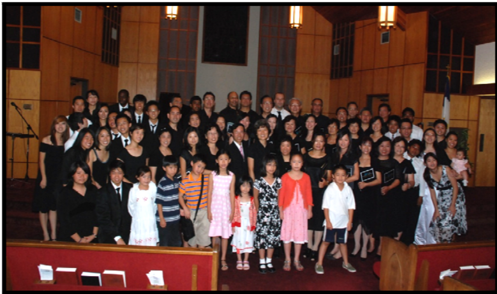
CHRISTMAS PROGRAM GROUP PICTURE