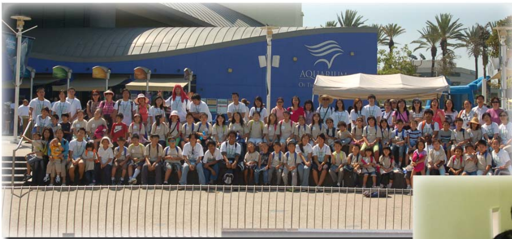
OUR SECOND ANNUAL VBS WAS A BUSY BUT EXCITING TIME FOR T.O.F.U. THE KIDS ENJOYED A FIELD TRIP TO THE AQUARIUM OF THE PACIFIC.