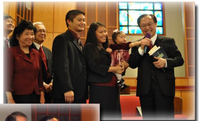
WE WERE BLESSED TO CELEBRATE THE START OF 2010 WITH A BABY DEDICATION.