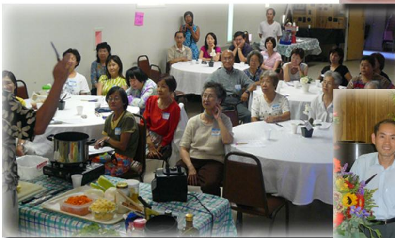
THE SACRED MUSIC CONCERT OPENED UP OUR 3RD EVANGELISTIC SEMINARS. IN 2009, WE CELEBRATED OUR FIRST ANNIVERSARY AS A CHURCH COMPANY.