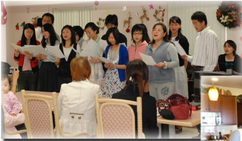
OUR YOUTH GROUP SHARED A MEANINGFUL SABBATH THROUGH MUSIC WITH THE ELDERS AT THE LOCAL RETIREMENT COMMUNITY.