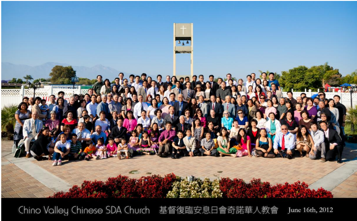
Chino Valley Chinese SDA Church 基督復臨安息日會奇諾華人教會 June 16th, 2012

Chino Valley Chinese SDA Church happy Family 奇諾華人教會全體教友