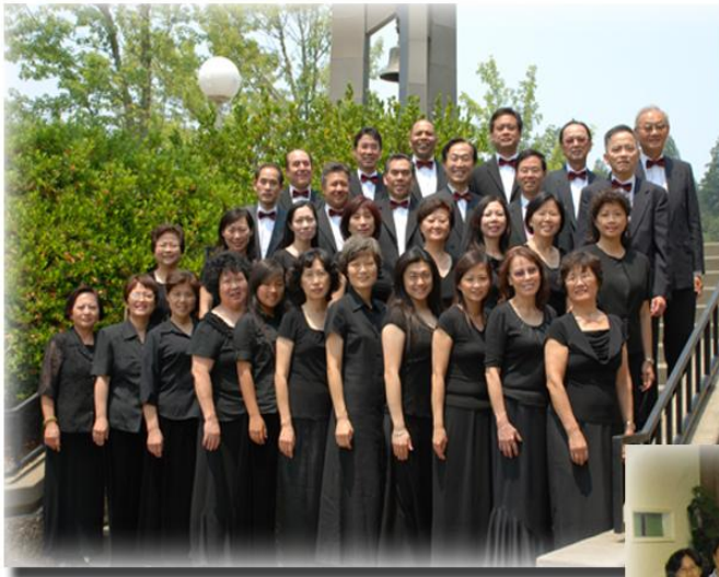
AS THE HHCAF FAMILY GREW, THE CHOIR FLOURISHED AND WAS INVITED TO PERFORM AT PUC. MEANWHILE, THE YOUTH ALSO FLOURISHED AND HELD THE FIRST OF OUR SUMMER VBS PROGRAMS.