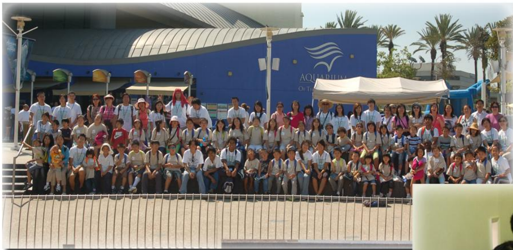
OUR SECOND ANNUAL VBS WAS A BUSY BUT EXCITING TIME FOR T.O.F.U. THE KIDS ENJOYED A FIELD TRIP TO THE AQUARIUM OF THE PACIFIC.