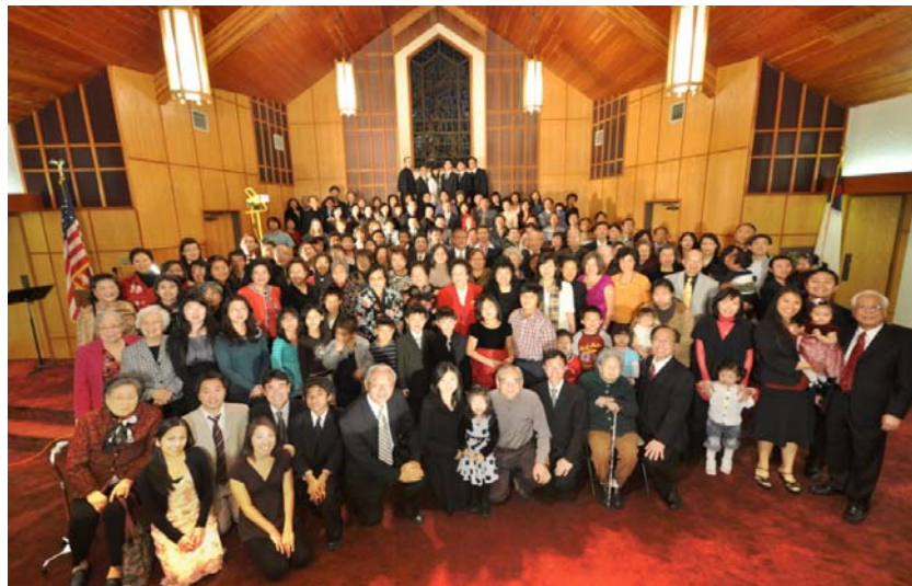
Hacienda Heights Chinese SDA Church happy Family 哈崗華人教會全體教友

To remove your name from the mailing list of this weekly newsletter, simply reply this e-mail address paulcho99@yahoo.com.hk . Thanks and God continue to bless you and family.