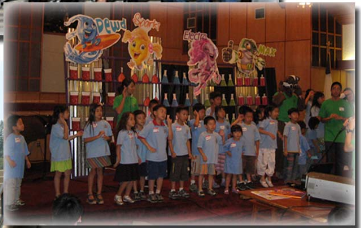
AS THE HHCAF FAMILY GREW, THE CHOIR FLOURISHED AND WAS INVITED TO PERFORM AT PUC. MEANWHILE, THE YOUTH ALSO FLOURISHED AND HELD THE FIRST OF OUR SUMMER VBS PROGRAMS.