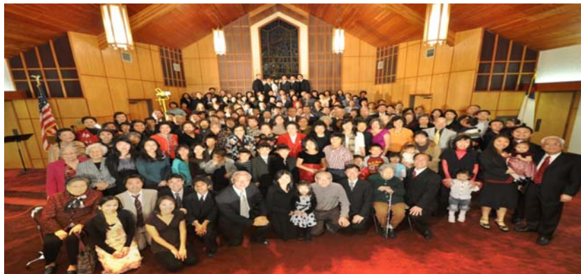
Hacienda Heights Chinese SDA Church happy Family 哈崗華人教會全體教友

2120 South Stimson Avenue Hacienda Heights, CA 91745 (626) 217-5782