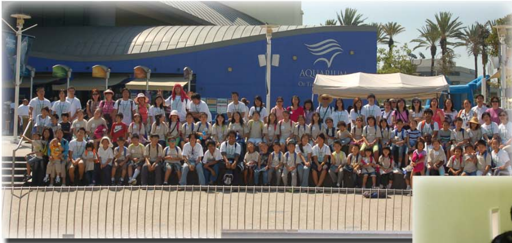
OUR SECOND ANNUAL VBS WAS A BUSY BUT EXCITING TIME FOR T.O.F.U. THE KIDS ENJOYED A FIELD TRIP TO THE AQUARIUM OF THE PACIFIC.