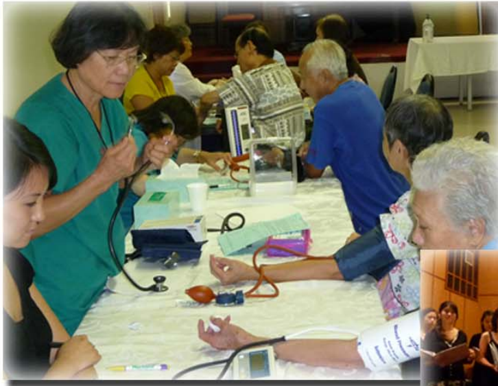
WE CONTINUED TO SERVE OUR COMMUNITY THROUGH HEALTH FAIRS AND HEALTHY VEGETARIAN COOKING CLASSES.