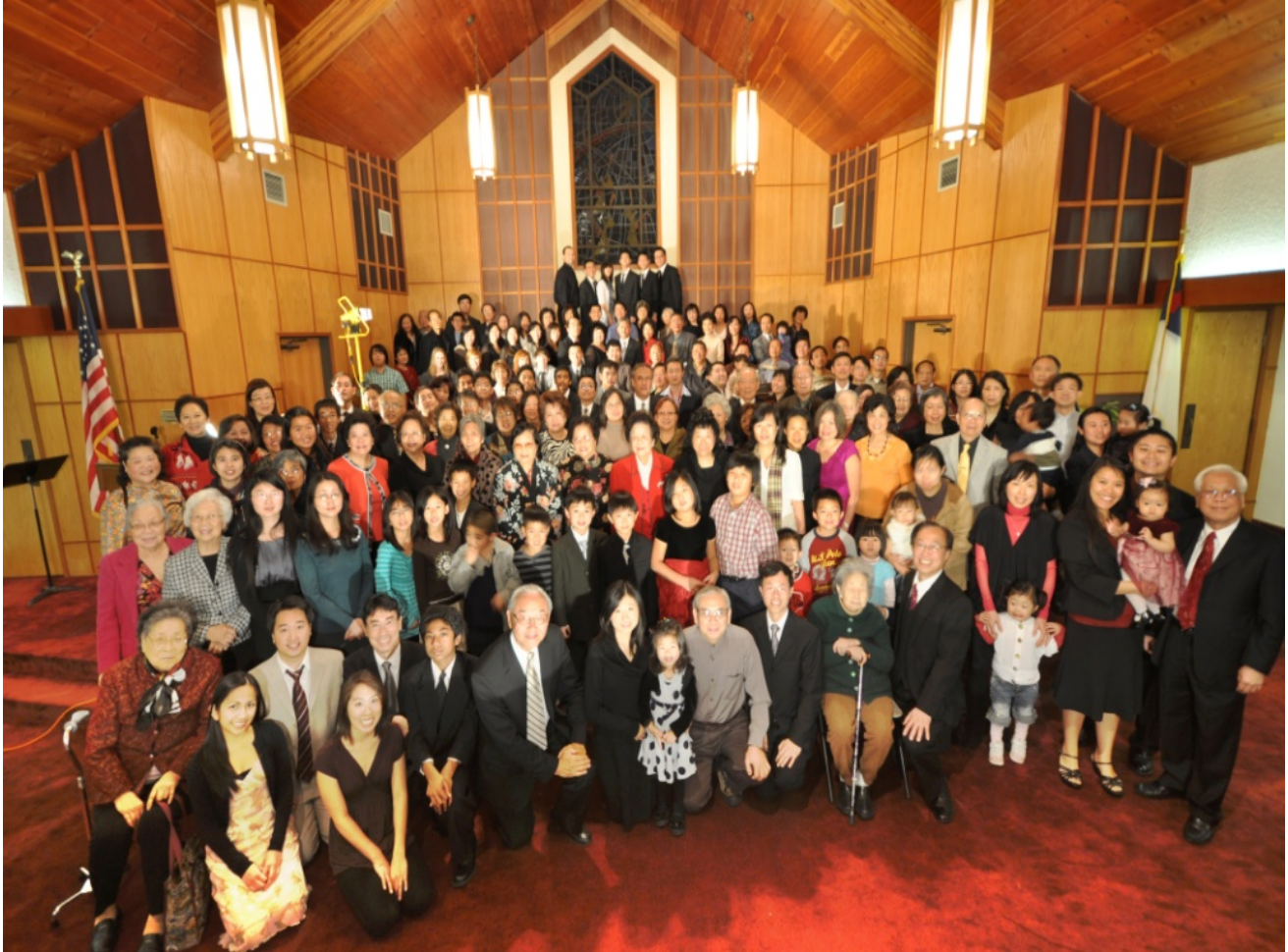
Hacienda Heights Chinese SDA Church happy Family 哈崗華人教會全體教友