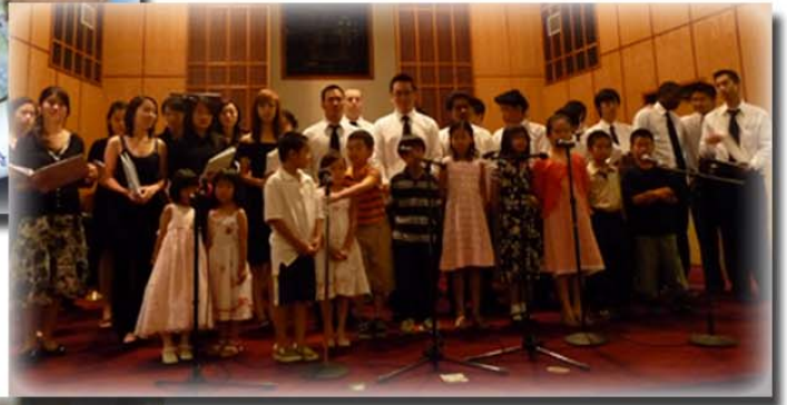
THE SACRED MUSIC CONCERT OPENED UP OUR 3RD EVANGELISTIC SEMINARS. IN 2009, WE CELEBRATED OUR FIRST ANNIVERSARY AS A CHURCH COMPANY.