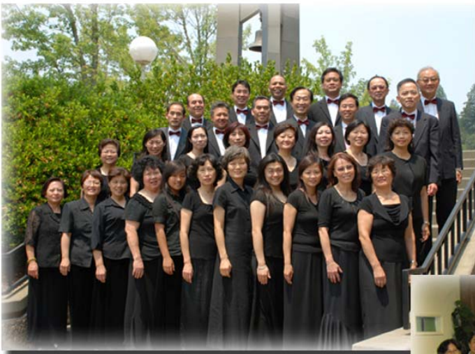
AS THE HHCAF FAMILY GREW, THE CHOIR FLOURISHED AND WAS INVITED TO PERFORM AT PUC. MEANWHILE, THE YOUTH ALSO FLOURISHED AND HELD THE FIRST OF OUR SUMMER VBS PROGRAMS.