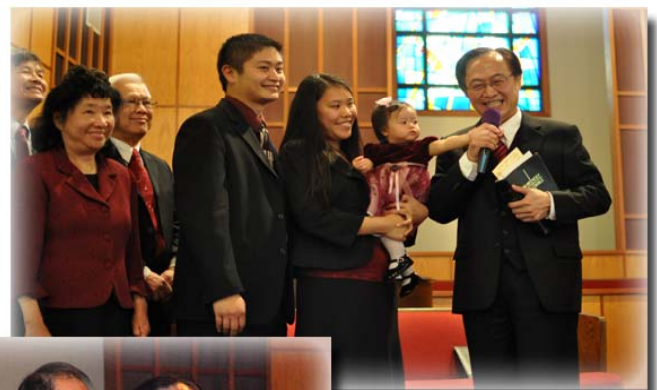
WE WERE BLESSED TO CELEBRATE THE START OF 2010 WITH A BABY DEDICATION.