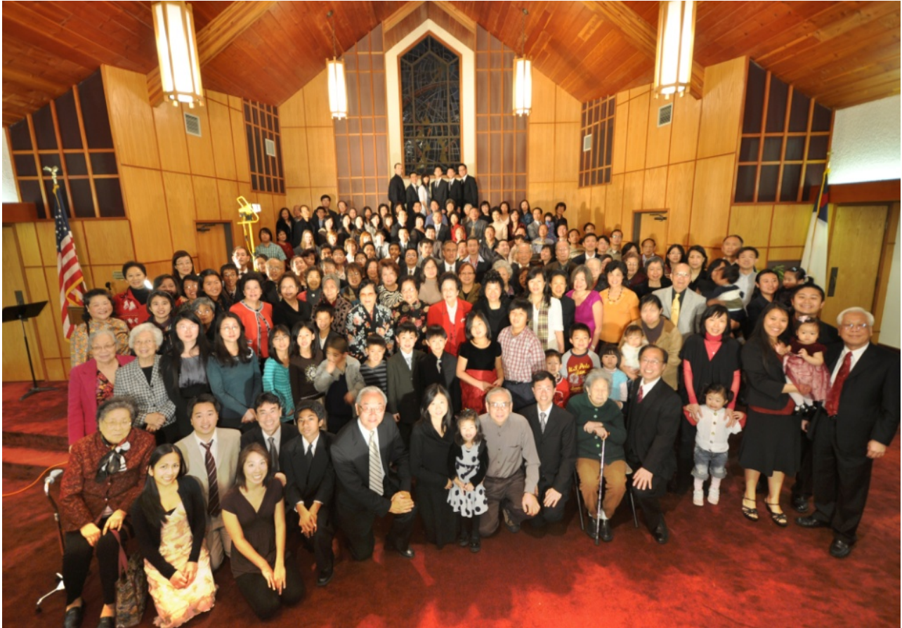
Hacienda Heights Chinese SDA Church happy Family 哈崗華人教會全體教友

To remove your name from the mailing list of this weekly newsletter, simply reply this e-mail address paulcho99@yahoo.com.hk . Thanks and God continue to bless you and family.