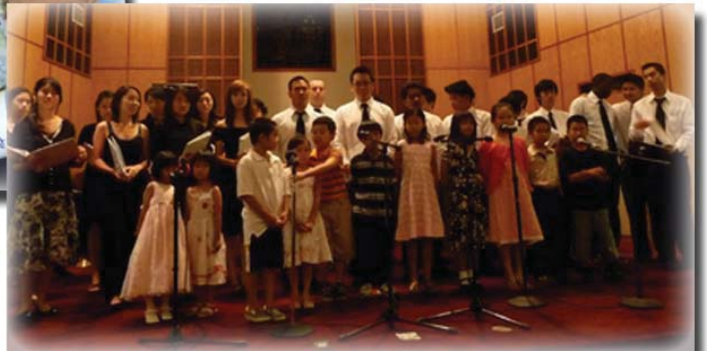
THE SACRED MUSIC CONCERT OPENED UP OUR 3RD EVANGELISTIC SEMINARS. IN 2009, WE CELEBRATED OUR FIRST ANNIVERSARY AS A CHURCH COMPANY.