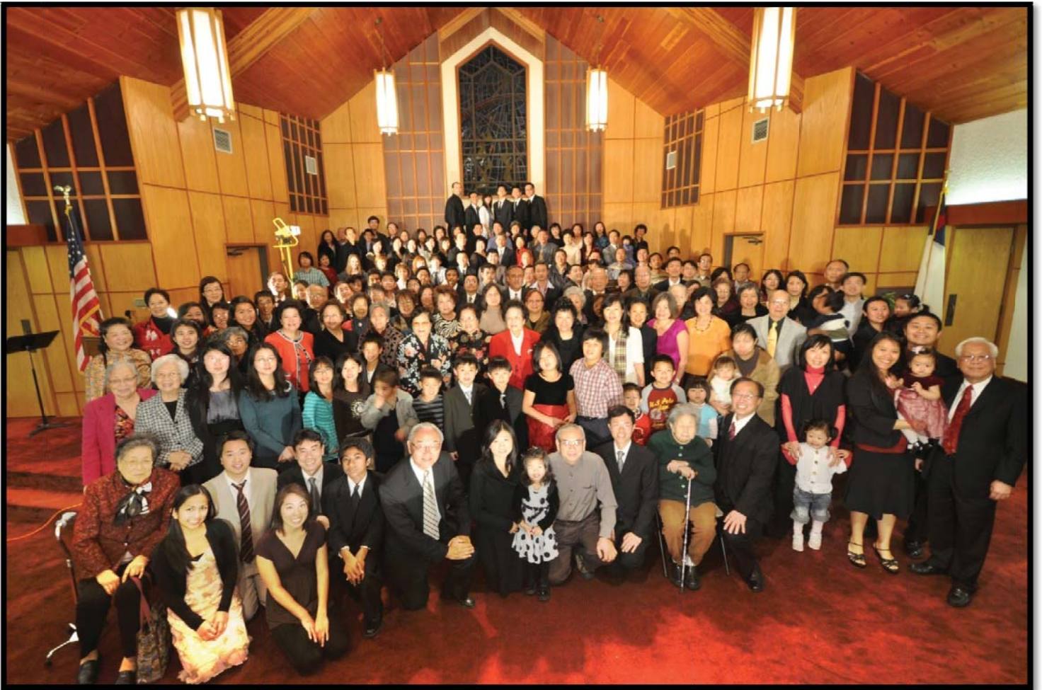
CHURCH FAMILY GROUP PHOTO 全體教友合照