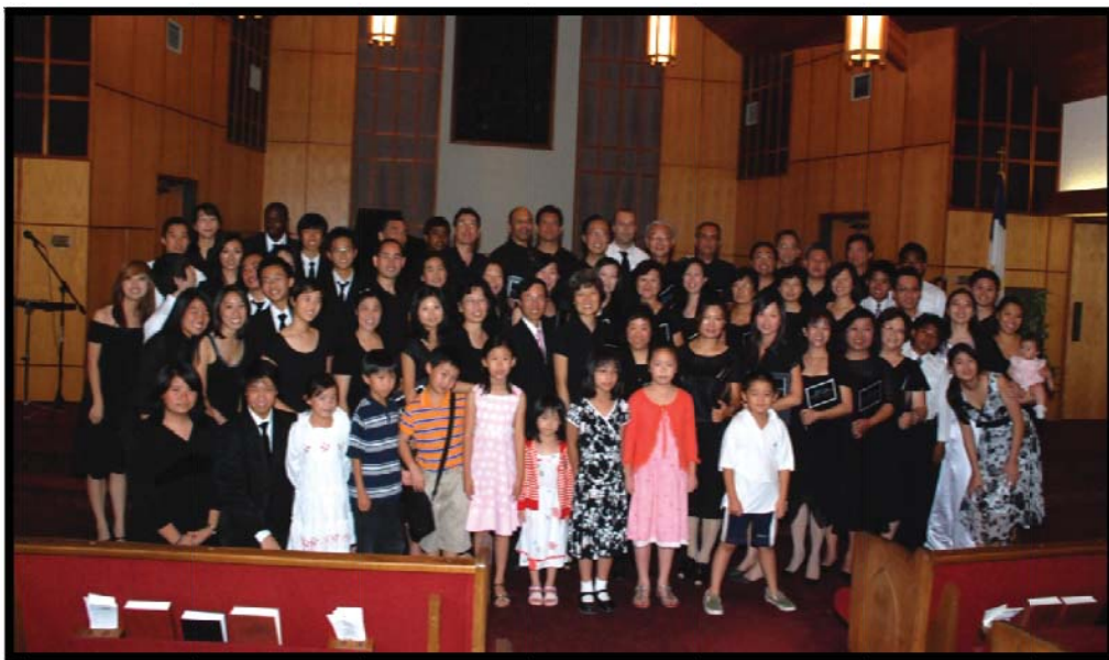
CHRISTMAS PROGRAM GROUP PICTURE