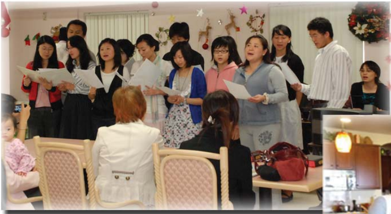
OUR YOUTH GROUP SHARED A MEANINGFUL SABBATH THROUGH MUSIC WITH THE ELDERS AT THE LOCAL RETIREMENT COMMUNITY.