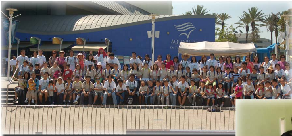
OUR SECOND ANNUAL VBS WAS A BUSY BUT EXCITING TIME FOR T.O.F.U. THE KIDS ENJOYED A FIELD TRIP TO THE AQUARIUM OF THE PACIFIC.