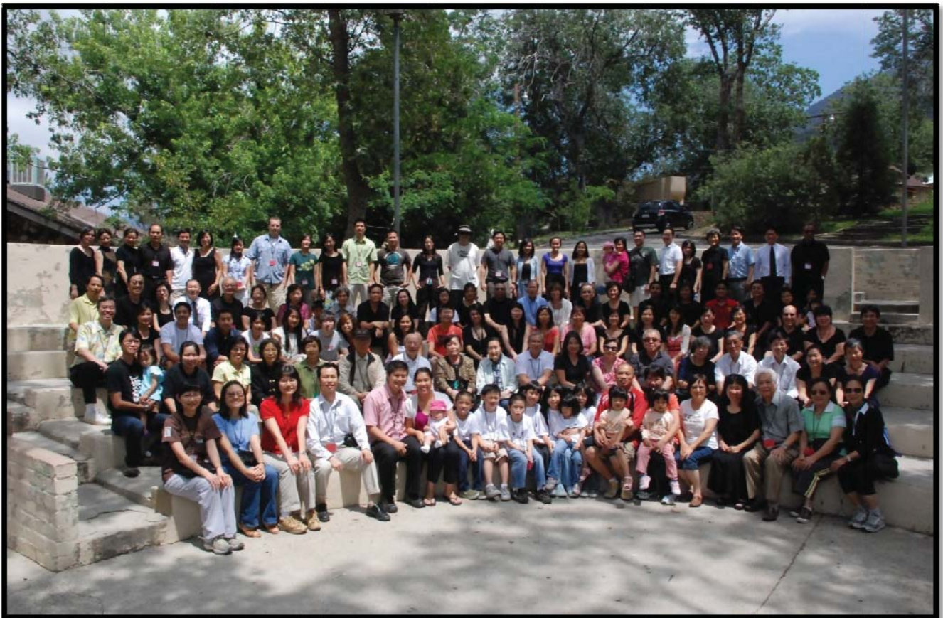
2009 CAMP CEDAR FALLS CHURCH RETREAT 2009年杉林瀑布營教會退修會

~~ WRITTEN BY PETE LOU AND TRANSLATED BY PAUL CHO~~