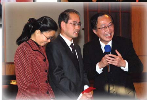
WE WERE BLESSED TO CELEBRATE THE START OF 2010 WITH A BABY DEDICATION.