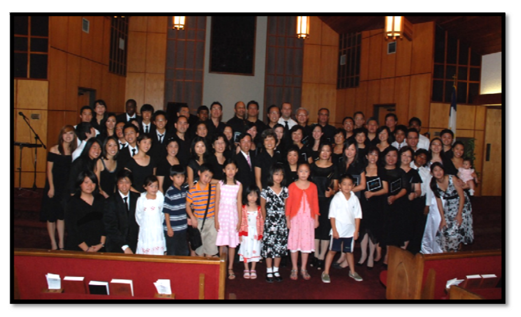
CHRISTMAS PROGRAM GROUP PICTURE 聖誕節目全體詩班合照