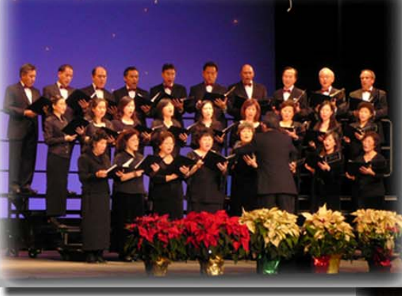
Our second fundraising concert showcased the various musical talents our church has been blessed with.