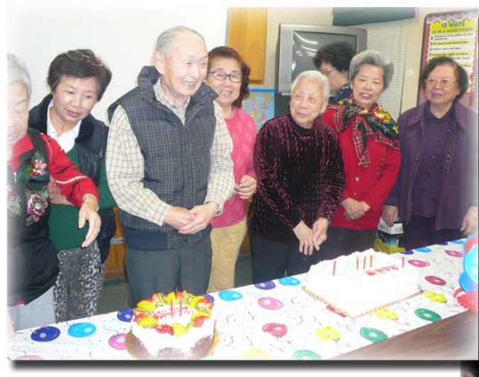
HHCAF remained active in the community providing cooking classes and health fairs. God continuted to bless our fellowship, and on Oct. 4, 2008, HHCAF was granted company status by the Southern California SDA Conference and became HHCSDAC.